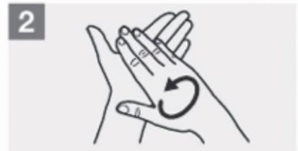
2 Rub hands palm to palm;