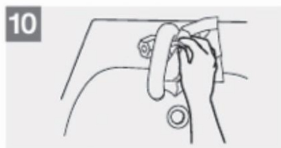
10 Use towel to turn off faucet;