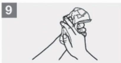
9 Dry hands thoroughly with a single use towel;