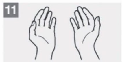
11 Your hands are now safe.