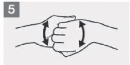
5 Backs of fingers to opposing palms with fingers interlocked;