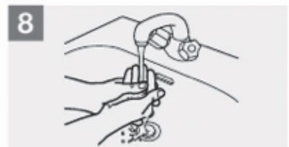
8 Rinse hands with water;