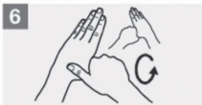
6 Rotational rubbing of left thumb clasped in right palm and vice versa;