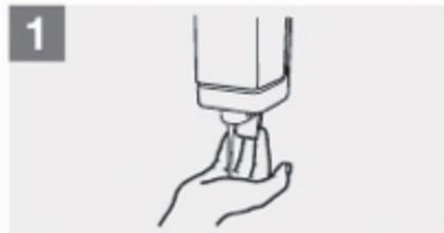
1 Apply enough soap to cover all hand surfaces;