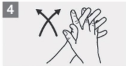
4 Palm to palm with fingers interlaced;